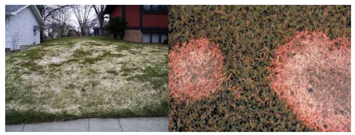
Irregular Matted Areas "Moldy" Appearance in Spring

Snowmold is most common to Kentucky Bluegrass and Fescues in regions where snow falls and sits on the lawn for extended periods of time. Growth takes place at temperatures as low as freezing (to slightly below freezing) and continues after snow melt in the spring for as long as the grass remains wet and the temperatures cold. Grey snow mold activity stops when the temperature exceeds 45 F or the surface is dry. Pink snow mold develops under a snow cover on unfrozen ground and also can develop in cool wet weather in fall and spring as long as the temperature is between 32 and 60 F.